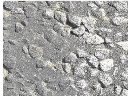
Before - After